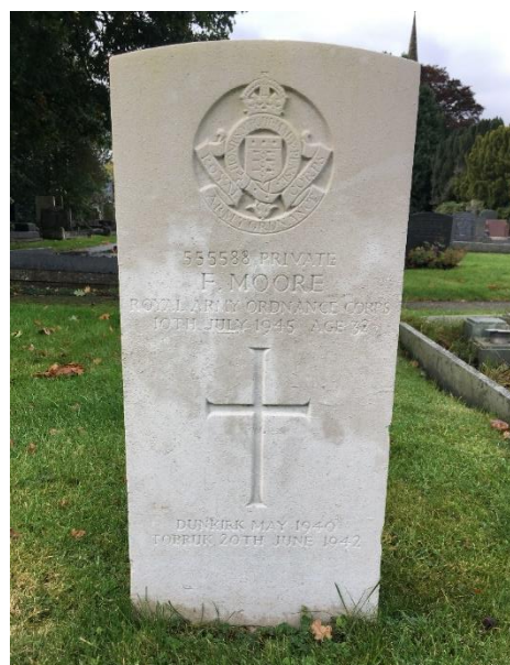
St Catherine's Churchyard, Burbage